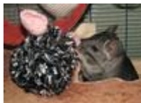
Nibbler refuses to play nice.

If you like my pattern, please consider donating a little bit of money to my Paypal account. I'm unemployed and impoverished :)