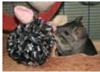
Nibbler refuses to play nice.

If you like my pattern, please consider donating a little bit of money to my Paypal account. I'm unemployed and impoverished :)