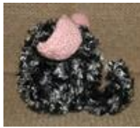
Where to attach the ears and tail...